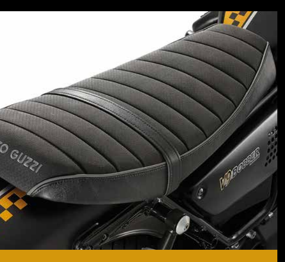
SLEEK SPORTS SADDLE